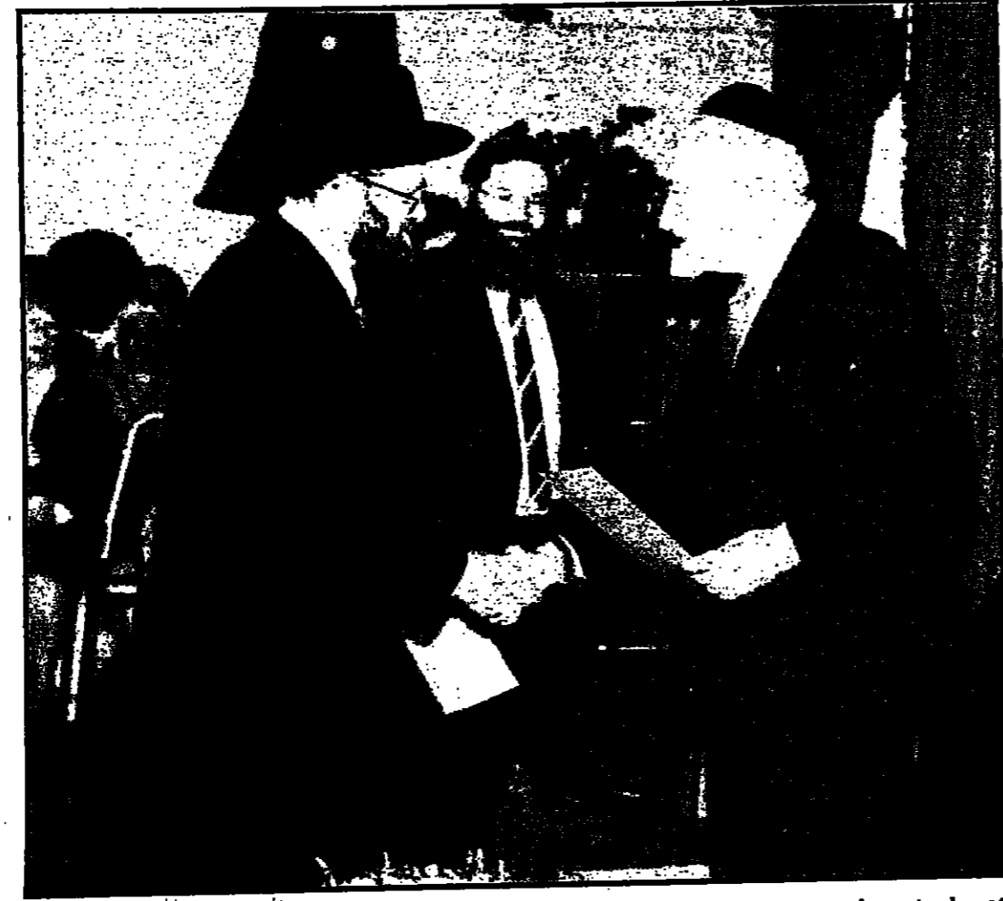
President Ezer Weizman shakes hands with one of the religious court judges sworn in yesterday at Beit Hanassi.

President Ezer Weizman and the two chief rabbis yesterday issued appeals on the second anniversary of prime minister Yitzhak Rabin's assassination for greater understanding between religious and secular Jews.